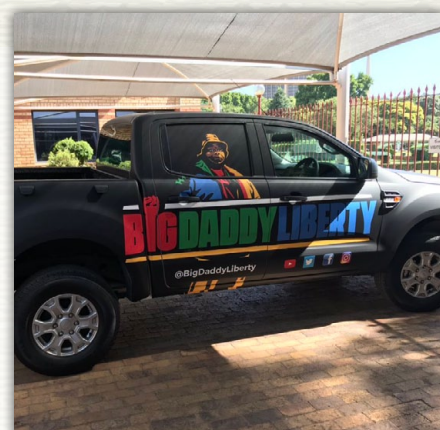
Look out for Big Daddy Liberty in his tour around South Africa

Our anticipated court challenge to EWC is progressing and we have assembled one of the most heavy-weight legal teams in the country. The legal strategy is to wait until relatively late in the legislative process before launching the challenge. None of this would be possible without your support.